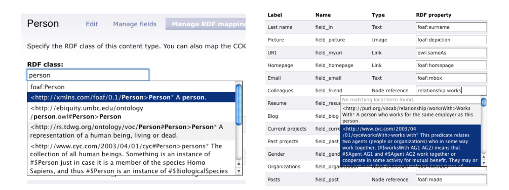
Fig. 2. RDF mappings management through the Drupal interface: RDF class mapping (left) and RDF property mapping (right).

Exposing RDF data with a SPARQL endpoint The first step to ensure interoperability on the Web of Data is to provide an endpoint which exposes RDF data. The RDF SPARQL endpoint module uses the PHP ARC2 library<sup>13</sup>. Upon installation, the module will create a local RDF repository which will host all the RDF data generated by the RDF CCK module (see Section 5.1). The site can then be indexed with a simple click. The RDF data of each node is stored in a graph which can be kept up to date easily when the node is updated or deleted. Fig. 4 (left) depicts a list of publications whose title contains the keyword "knowledge".