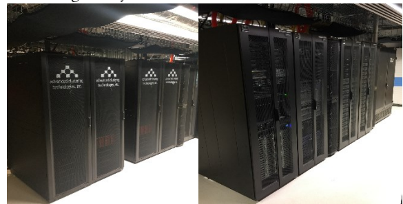
Figure 1: (Left) USD Legacy supports general computational tasks. (Right) USD Lawrence supports general computational tasks as well as high-memory and GPU partition requests.

The USD gateway provides a dedicated set of web interfaces for gateway administrators called the ‘Admin Dashboard’, which provides interfaces required for managing gateway configurations and users. The Admin Dashboard features include interfaces to manage users, add software tools, maintain credential store keys for secure SSH communications [5], and add HPC configuration information. Job statistics are also available through the Admin Dashboard which includes gateway usage summaries, user specific software utilization, and status of HPC jobs and failures. These statistics are essential for a gateway administrator in order to best serve the gateway user community in resolving their issues and advising them on their HPC usage. Experiment statistics can be listed based on a date and time period provided by the administrator and further filtered by username, HPC resource, and software. Gateway administrators can then view the number of FAILED, RUNNING or CANCELLED experiments at a given time and understand the status of the gateway user activities.