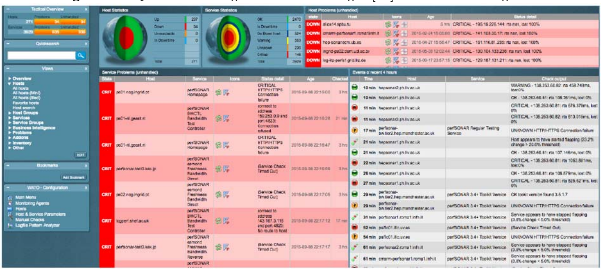
Figure 1. Open Monitoring Distribution Nagios[16] based monitoring tools

A sample of the OMD display is presented in Figure 1.