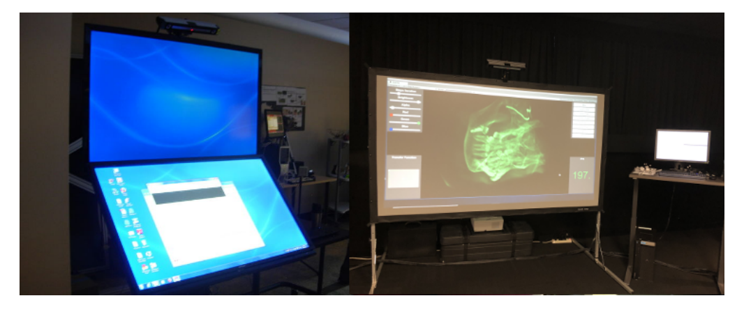
Figure 1: Examples of IQ-Stations. The left system with the lower touch display is deployed at University of Indiana's Advanced Visualization Laboratory. The system on the right is deployed at Idaho National Laboratory's Applied Visualization Laboratory showing a Unity 3D based volume renderer.

Shane Grover Idaho National Laboratory Idaho Falls, Idaho shane.grover@inl.gov