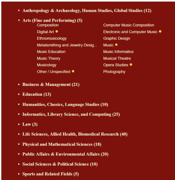
Figure 3: Disciplines available for user selection on Big Red II. The Arts (Fine and Performing) section is expanded to show the five sub-disciplines that are represented on Big Red II.

in their labs, but delegate the actual use of the computer and do not personally have accounts on the system. Data for usage and satisfaction of IU high performance computing systems and supercomputers for the last two years are displayed in Table 1. The community surveyed is what we traditionally think of as the research community – faculty, staff, and graduate students. Full details are available online at [19], and contains yearly survey information from the last 20+ years.