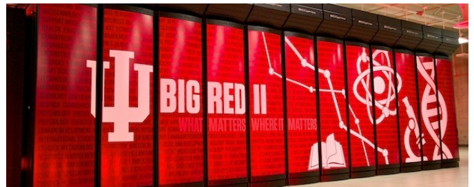
Figure 1: Big Red II in the IU data center.

Big Red II is the flagship supercomputer of the university; but there are other HPC machines at IU. They are Karst (a high throughput and serial jobs cluster) and Mason (which is designed for high memory jobs). In addition, IU also runs Jetstream [31, 33] and Wrangler [17] that are part of the XSEDE [38] national cyberinfrastructure. These two systems are available to researchers across the country through an allocation system. In addition to the compute resources, we have storage systems that make it possible to use the supercomputers at scale. HPC users produce large amounts of data during their runs that require a huge number of I/O operations. The Data Capacitor II [6] filesystem is 6 PB parallel file system that can support this kind of usage. There is a home file system for more permanent storage for data that is used day to day and a 15 PB tape archive for archival needs.