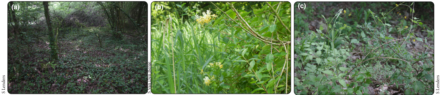
Figure 1. Examples of focal liana species found in the understory of temperate deciduous forests across Europe: (a) ivy ( Hedera helix ), shown here in the understory of a deciduous forest in Viroinval, Belgium; (b) honeysuckle ( Lonicera periclymenum ), shown here in a hedgerow in Campine, Belgium; and (c) traveller's joy ( Clematis vitalba ), shown here in the understory of a deciduous forest in Viroinval.

data for site-level climatic conditions and atmospheric nitrogen deposition from online databases. Additional details regarding environmental variation across plots and sites, and the methods used to assess these, are presented in WebPanel 3 and WebTables 2–4. We are aware that EIV provides only an indirect depiction of environmental conditions, and that direct characterization of prevailing environmental conditions is necessary for advancing understanding of forest ecology.