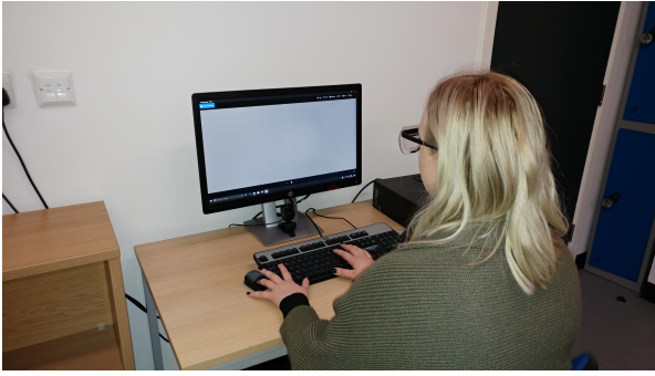
Fig. 2 Setup - A participant ready to perform the task.