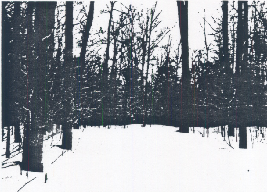
Research is needed on how and why specific ecosystems and landscapes change over time.

general perception that forests are primarily sources of commodities for human consumption—tangible flows separable from the system and often characterized in economic terms. Some of the most visible (and volatile) political issues in forestry relate to reductions in stocks or disruptions in flows; for example, the loss of individual species or economic dislocations resulting from reduced timber harvests. But a more appropriate focus for many major forest issues—forest fragmentation, biological diversity, forest health, long-term sustainability—is the state of the ecosystem. A shift in perspective, from concern with stocks and flows to concern with states and associated stocks and flows, may be a “scientific revolution” (Kuhn 1970).