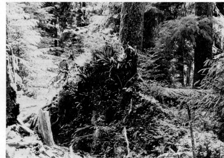
Figure 2. Even death can contribute important ecological work. Uprooting of trees in coastal Alaskan Sitka spruce-western hemlock forests is an important factor retarding development of iron pans (impervious layers of mineral deposits) and consequent paludification of forest sites.

Diseases may also kill trees or may predispose them to mechanical failure. For example, a large percentage of windthrown old-growth Douglas firs ( Pseudotsuga menziesii ) contain significant butt rot ( Polyporus schweinitzii ). Both insects and disease may be the proximate agent of death in trees already weakened by other factors; as such, they often are blamed for deaths more properly as-