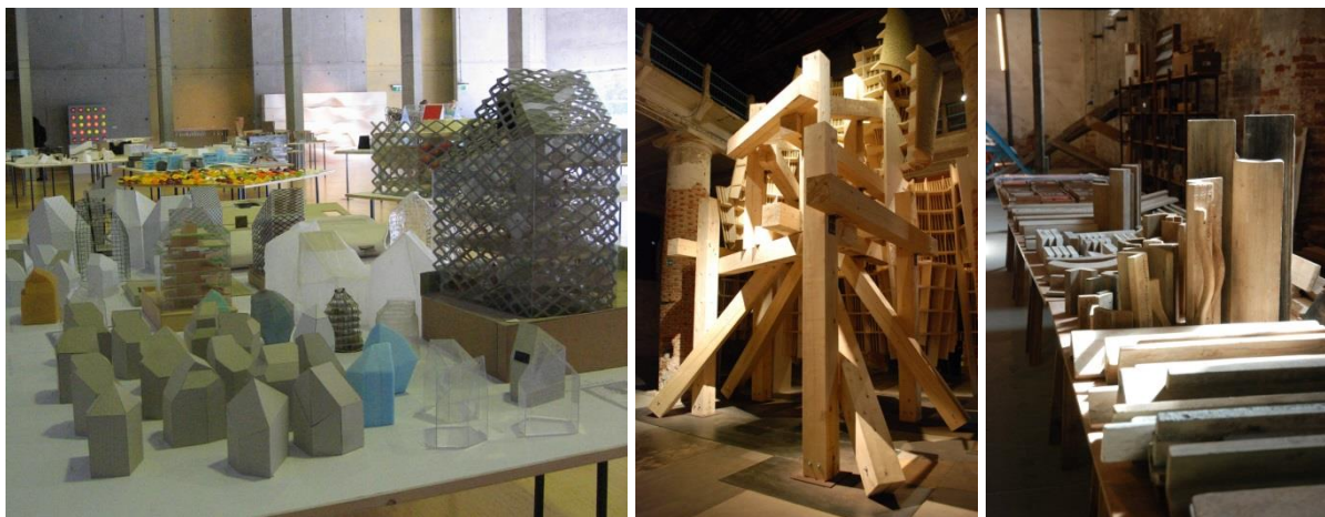
Figure 1 (Left): The exhibition “Beauty and Waste” by Herzog & de Meuron showed the physical traces of design and thought processes that every project leaves behind in the form of models, sketches and material samples. Herzog & de Meuron, NAI Rotterdam, 2005.

In architectural and design thinking, artefacts play a central and important role, both as bearers of knowledge and as results of making processes, and the material and immaterial artefacts are used in several ways, during and after the actual design processes. The theme of these processes as explorative practices, involving material-making and its tools, is often discussed in architectural installations and exhibitions (fig. 2 & 3). Making is a way to work with, and integrate, all the different perspectives that are characteristic of architecture; merging contradictory elements and aspects into a whole is part of design ability. The making of objects and artefacts also generates and embodies specific forms of knowledge.