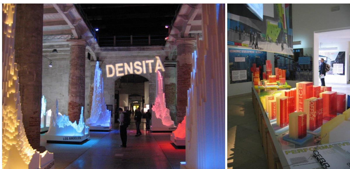
Figure 6 and 7: Physical models visualising and exploring the density and spatial character, as well as complex relationships, of several global cities. The 10th Architectural Biennale “Cities. Architecture and Society”, Venice, 2006.