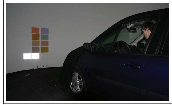
Figure 1. Experimental conditions for the first experiment. The projector illuminates an NCS patch and displays a virtual patch next to it.

To obtain psychophysical functions, the constant-stimuli method was used, with the two-alternative forced choice (2AFC) procedure. 20 During the test, a computer program randomly illuminates, using a calibrated Barco Galaxy NW-12 sRGB projector with \gamma = 2.2 and a D65 white point, one of the NCS patches and, simultaneously, a virtual color next to it (see Figure 1, which shows the white patch). Usually, a gray background is used to compare two colors. 21 For our application, we used the mean