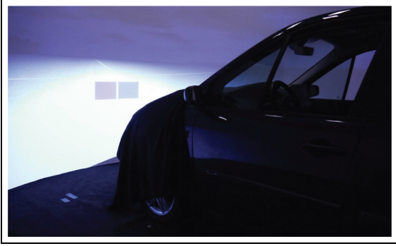
Figure 2. Experimental conditions for the second experiment.

In this experiment, the population was composed of three color experts from Renault (design department). Two persons worked on industrial quality validation and the other person worked on color and material assessment. Because of the expert nature of this population, we considered, as a predicate of this experiment, that their results should be highly close among themselves and that the result would not depend on the number of participants.