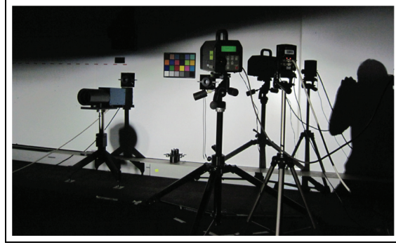
Figure 3. Real measurement conditions for the Macbeth ColorChecker chart white patch.

To avoid color modification of the entire scene, we applied a fragment shader only to the three-dimensional headlight projection. This fragment shader modifies the color using the von Kries chromatic adaptation model (see Equation (3)), where full adaptation by the observer is assumed. The CAT matrices used in this work are listed in Table 1.