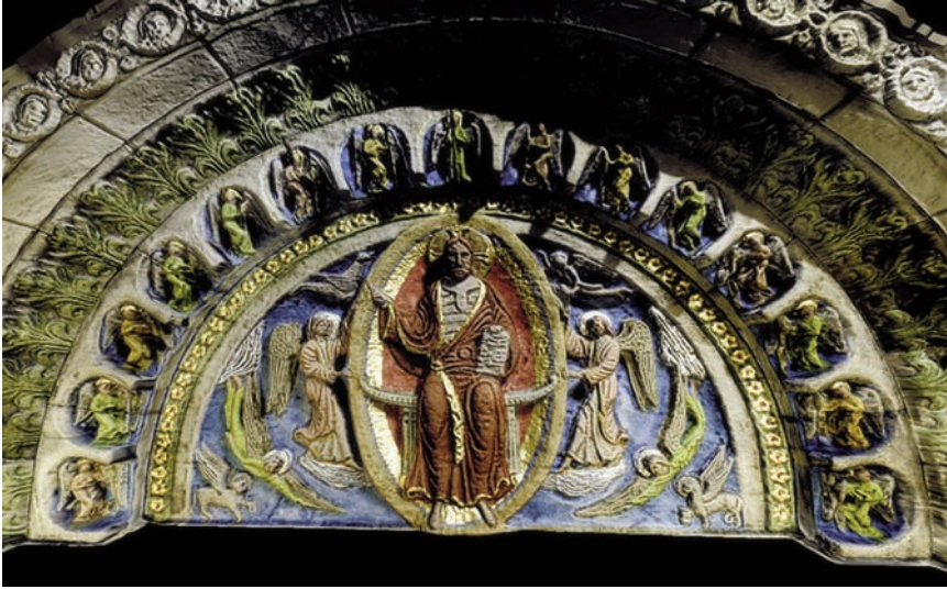
Figure 4. First try of coloured restitution.