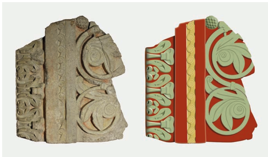
Figure 1. Fragment of the first jamb (limestone, 40x35 cm) and coloured restitution. Reproduced with permission of S. Castandet and A. Mazuir, Arts et Métiers ParisTech, Cluny, France.

Two samples, taken from the background of the lintel, presenting only the layer of lead white mixed with carbon black, were visually blue. Is it a deliberate optical effect, or is it due to the sampling?