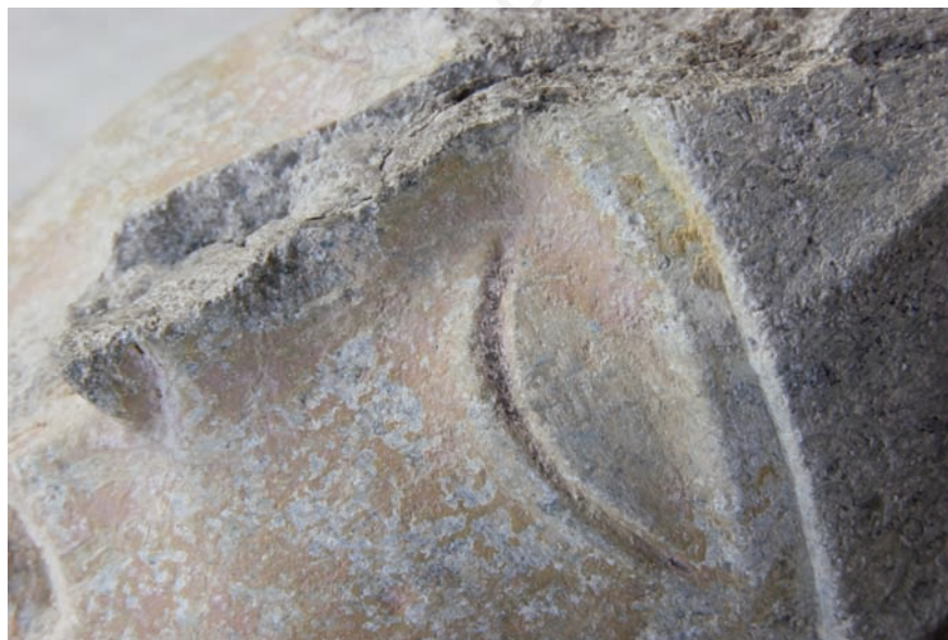
Figure 3. Head of the sleeping soldier (limestone, 16x9 cm) coming from the lintel.