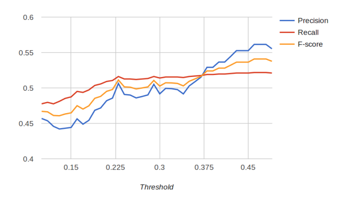
Fig. 2. Determining optimal value of threshold; Discussion Forum posts, word2vec, All-words approach