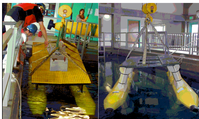
Figure 4. The MBARI Santa Clara University SWATH (Small Waterplane Area Twin Hull) vehicle.

In order to further improve the basic ASC SCOUT for use as a station keeping buoy, alternate hull forms are being evaluated and tested. Included in this list are multi-hull designs and SWATH (Small Waterplane Area Twin Hull) options. Lastly, autonomous docking and battery charging is being explored as a component for future development.