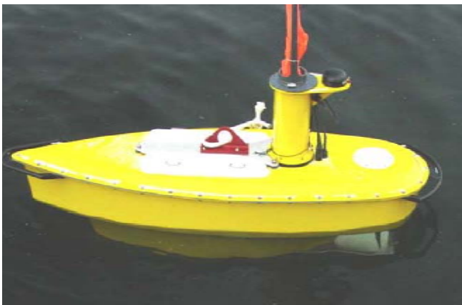
Figure 2. NUWC Station keeping buoy.

Deployment of multiple un-tethered self-positioning vessels in conjunction with traditional moored buoys may offer another potentially useful operational scenario. Moored buoys offer certain advantages over their un-tethered counterparts, including: the ability to ride out rough weather with minimal expended energy; larger power storage capacity; reliable communications to and from land-based stations; and, the elimination of sophisticated navigation and control software. These advantages weigh in against drawbacks including: fabrication and maintenance costs; deployment costs; limited effective sensor range; and, the potential for entanglement and/or loss due to weather and collisions. However, let us consider a hybrid approach whereby we deploy a single moored buoy which can dock with multiple low-cost highly mobile vehicles with position-keeping capabilities. The docking buoy could provide adequate power for recharging the mobile assets, act as a relay station with increased power for increased wireless range, and permit the potentially more vulnerable mobile assets to dock and maintain position during inclement weather without expending significant energy.