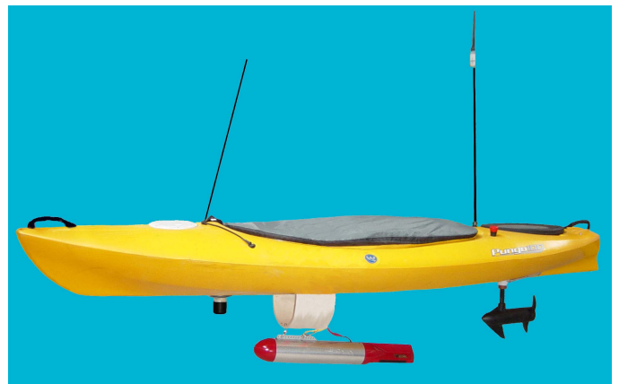
Figure 1. ASC SCOUT Vehicle outfitted with acoustic modem and sidescan..

Recently developed station keeping autonomous buoy platforms may be particularly useful for situations where rapid buoy platform deployment is required [1],[2]. Other justifications for self-positioning buoys include increased mobility of these platforms, dynamic network capability (i.e. the ability to interact with each other in response to ambient conditions or directives), and they can reduce deployment and maintenance costs.