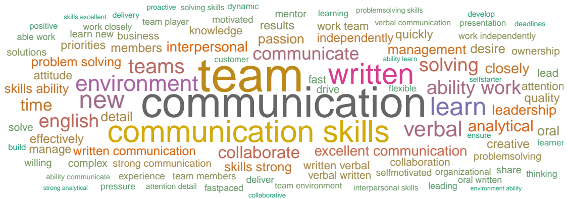
Figure 4: Soft skills word cloud.